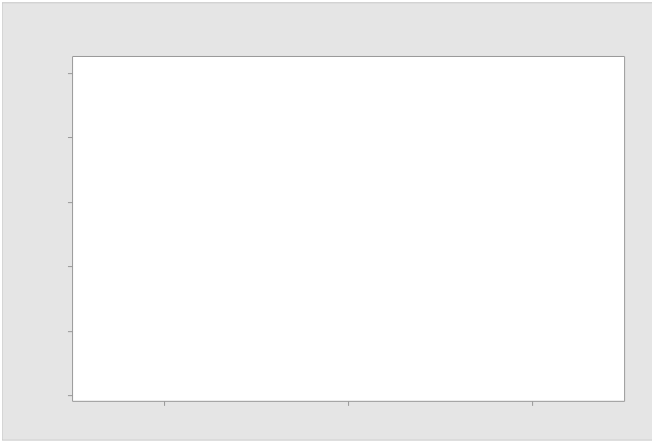
Fig 5. Size distribution of LEHDP particle types

Subjectively, these have been classified into 5 types. The smallest particles are spherical in morphology those with a stains. Fig. 5 shows the size distribution observed when sampling 100 particles on 10 wafers implanted with 1x LEHDP implants. The EDX data are shown in Fig. 6 the right plot is a plot of a ring/stain particle. Phosphorus only appears as a small signal for the spherical particles but is absent from the stains, indicating that the dopant has reacted